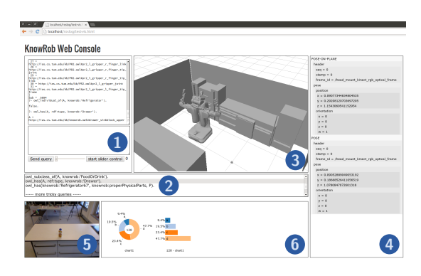
Figure 1: The web interface of OPENEASE. Image reproduced from [3].

Appears in: Proceedings of the 14th International Conference on Autonomous Agents and Multiagent Systems (AAMAS 2015), Bordini, Elkind, Weiss, Yolum (eds.), May 4–8, 2015, Istanbul, Turkey. Copyright © 2015, International Foundation for Autonomous Agents and Multiagent Systems (www.ifaamas.org). All rights reserved.